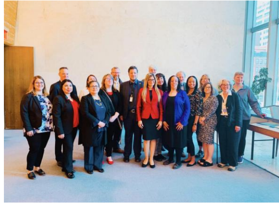
United Nations - "Role of Libraries in "How Strengthening our Communities."