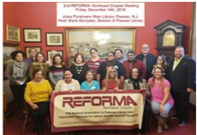
Julius Forstmann Main Library, Passaic, N.J

REFORMA Northeast Chapter 3rd Annual Book Buzz Friday January 18, 2019 Penguin Random House New York, NY