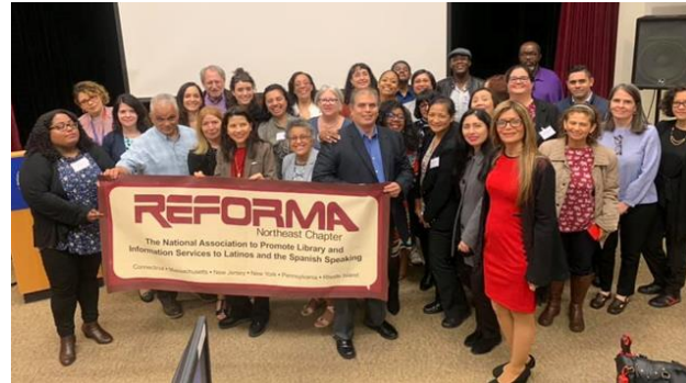
15th Annual Joint Mini-Conference Langston Hughes Community Library Queens, NY