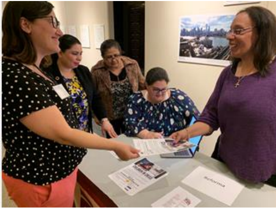
First Annual Early Childhood Symposium, Immigration Policy Impacts Young Children" BPL